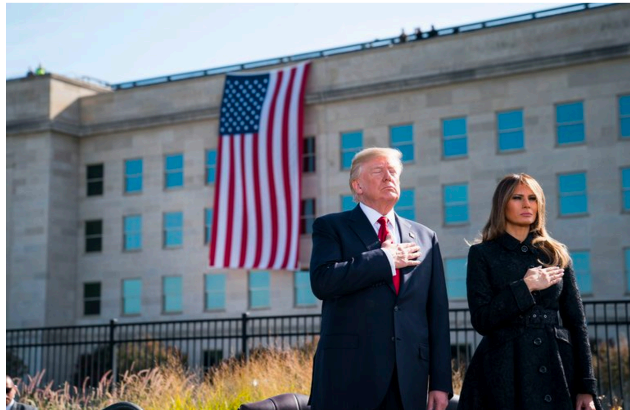
President Trump and Melania, his wife, participated in a September 11th observance at the Pentagon National