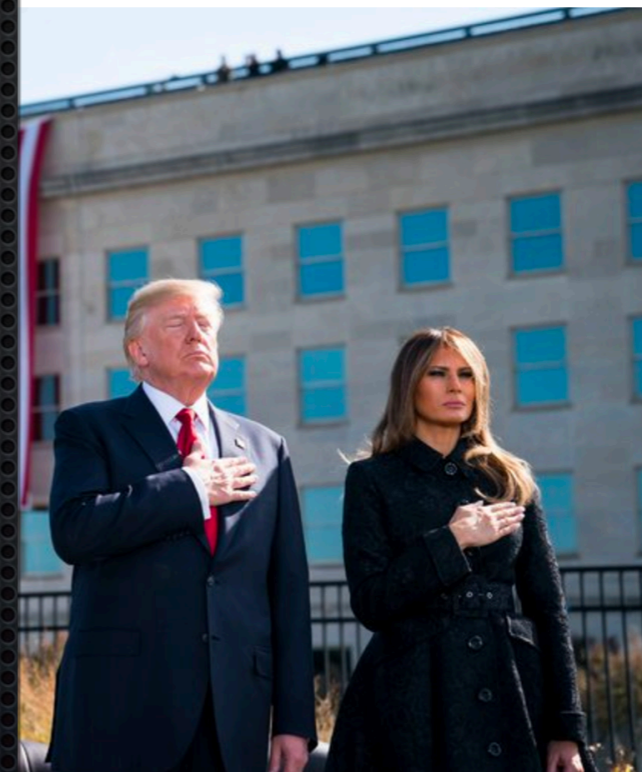
September 11th observance at the Pentagon National