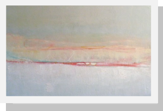
Water Study, Delray Beach

Abstracts, bringing us the beauty and joy of SUN AND SEA